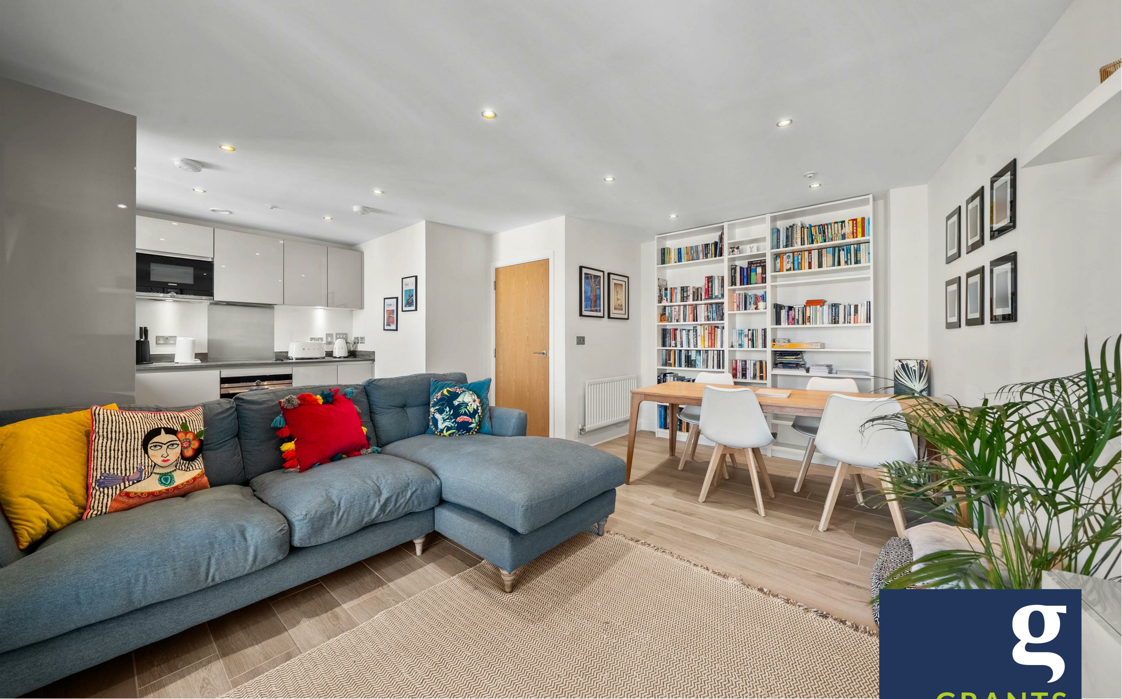
Hawker Drive, Addlestone, KT15 2FA